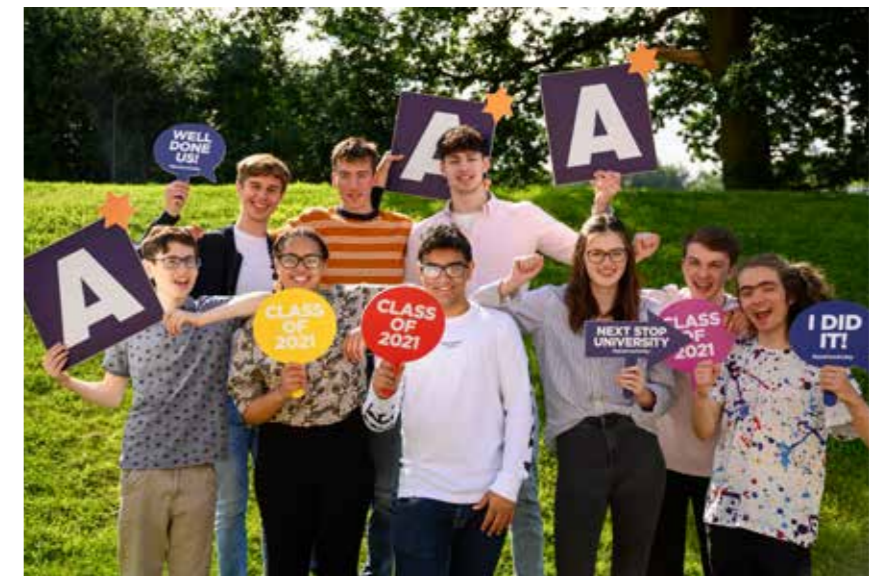
Added value in The Grammar School at Leeds Sixth Form

The table below provides recent examples of how students in our sixth form achieved enhanced grades and secured offers from leading universities.